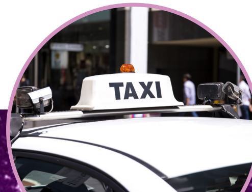
How To Get There Click here