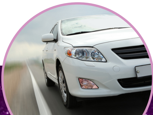
How To Get There Click here