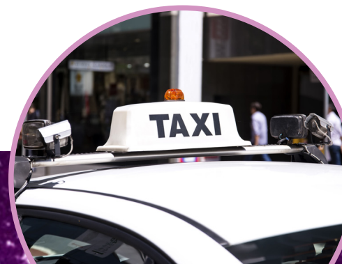
How To Get There Click here