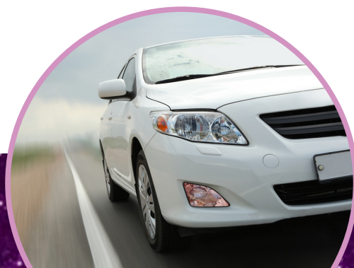
How To Get There Click here