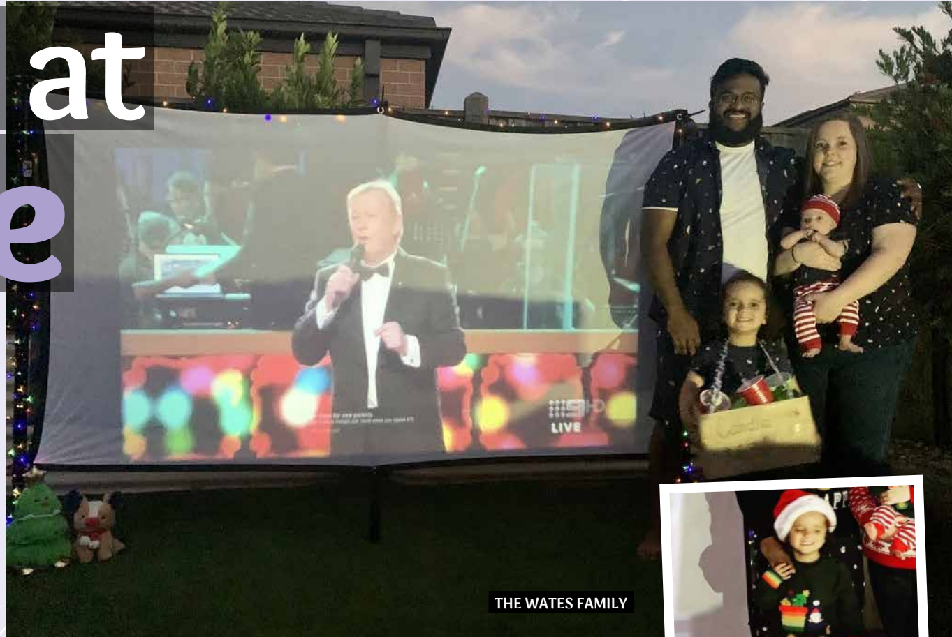
THE WATES FAMILY