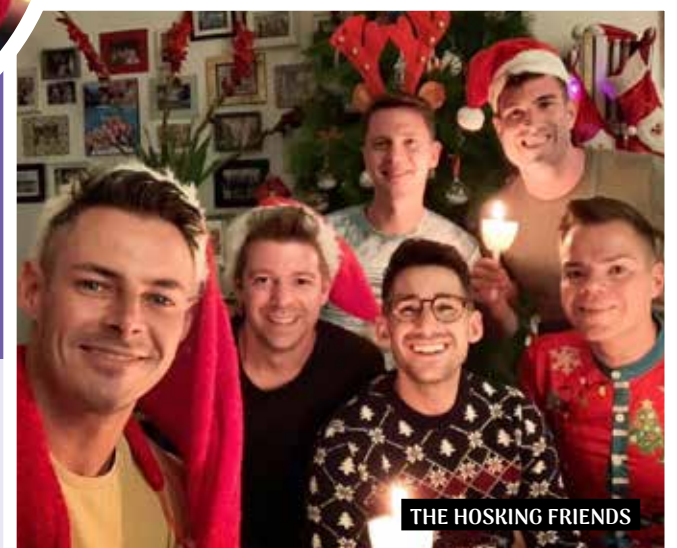
THE HOSKING FRIENDS