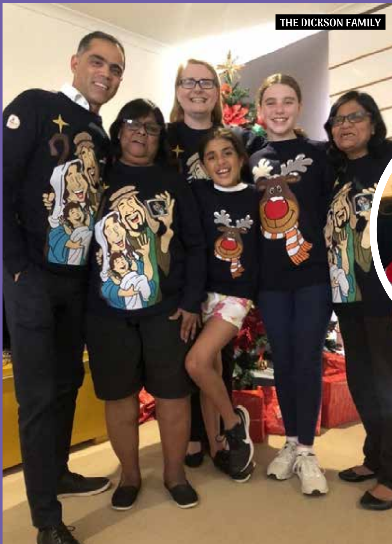
THE DICKSON FAMILY

C hristmas stories around the tree is our family tradition before Carols. The grandkids love it!