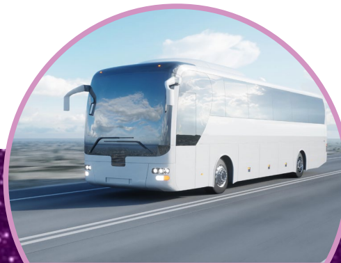
Public transport options: www.ptv.vic.gov.au