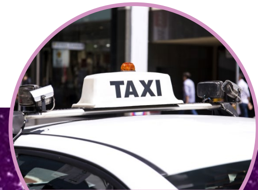
How To Get There Click here