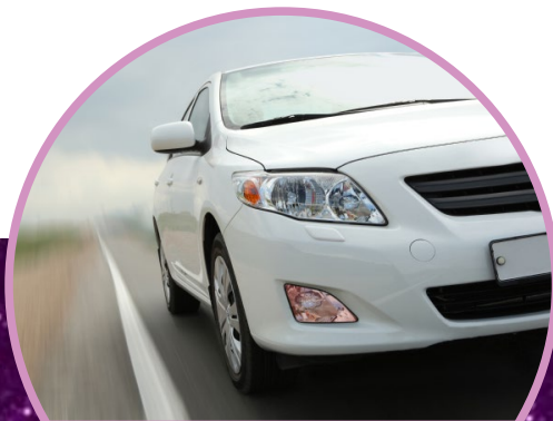
How To Get There Click here